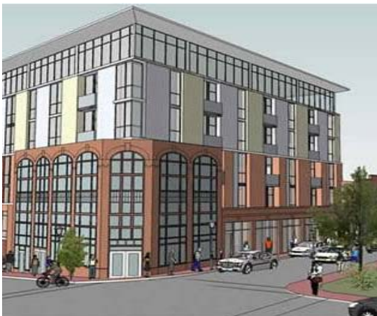
Eagle Market Place