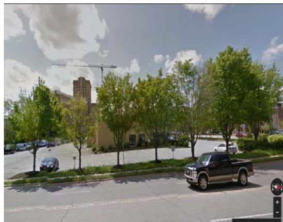
City Center, 311 College Street