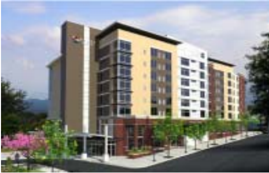
Hyatt Place Hotel, 183 Haywood Street