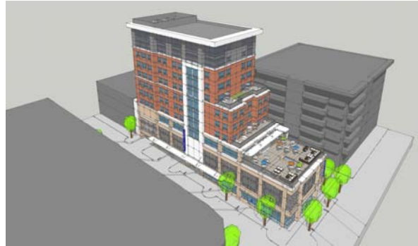
Cambria Suites, Battery Park and Page Avenues